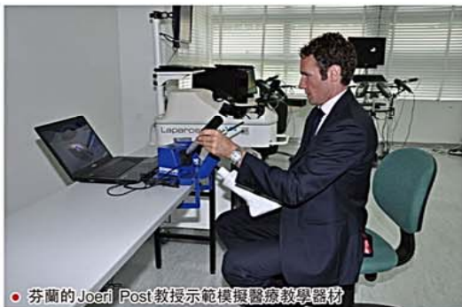
● 芬蘭的Joeri Post教授示範模擬醫療教學器材